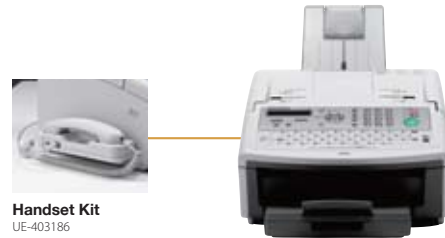
Handset Kit UE-403186