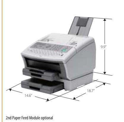
2nd Paper Feed Module optional