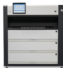
KIP 940 Print Copy & Scan System