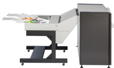
KIP 940 Print System